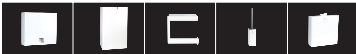
paper towel dispenser SF-100